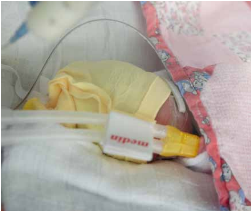
Premature 600 gr NIV NAVA patient