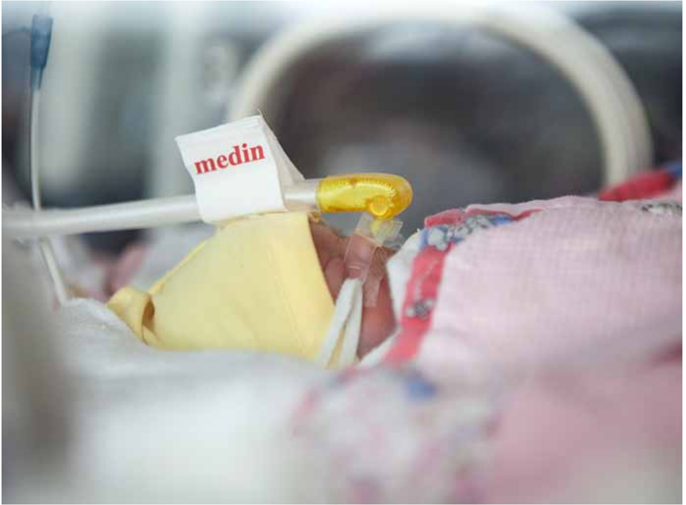
A 600 gram infant patient being ventilated with NIV NAVA