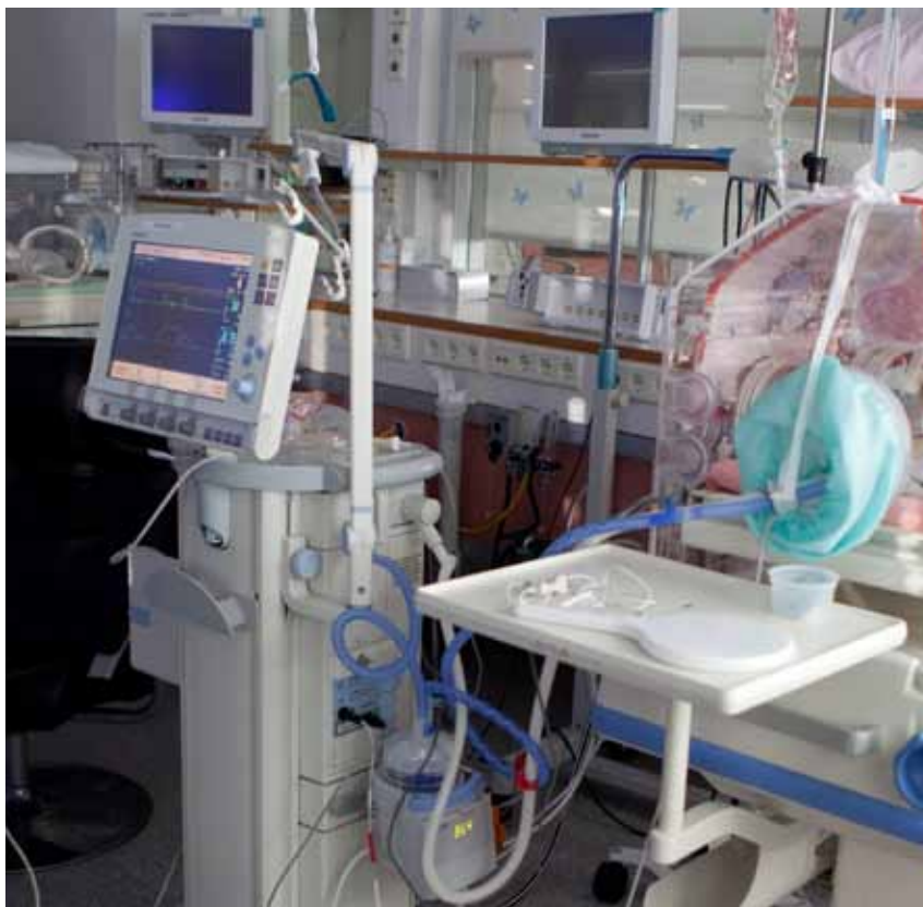
SERVO-i delivering NIV NAVA to neonatal patient

It was surprisingly easy; it was one of these things where you immediately see the benefits, which makes it easier to accept as new method or tool. Nurses and parents see the babies sleeping more comfortably and for all of us seeing how some of our babies need less medication makes us feel that this is the right thing to do. The nurses all understand the concept and application of NAVA. We also have many physicians on call who have learned quickly the NAVA concept, and NAVA has succeeded very well also during on-call hours.