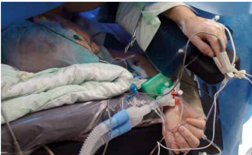
A patient undergoing lung surgery, lying in lateral decubitus position, Sahlgreńska University Hospital