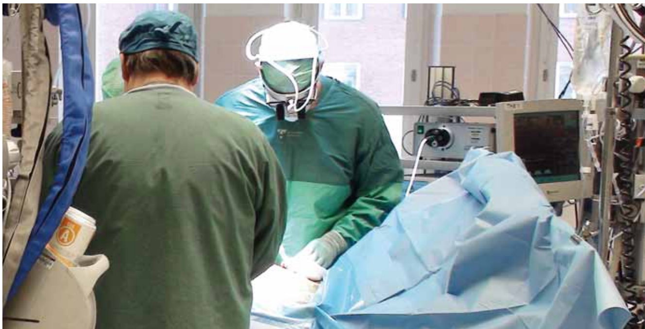
Cardio-thoracic surgery underway in the Cardio-thoracic Surgical Center, Sahlgrenska University Hospital, Gothenburg, Sweden