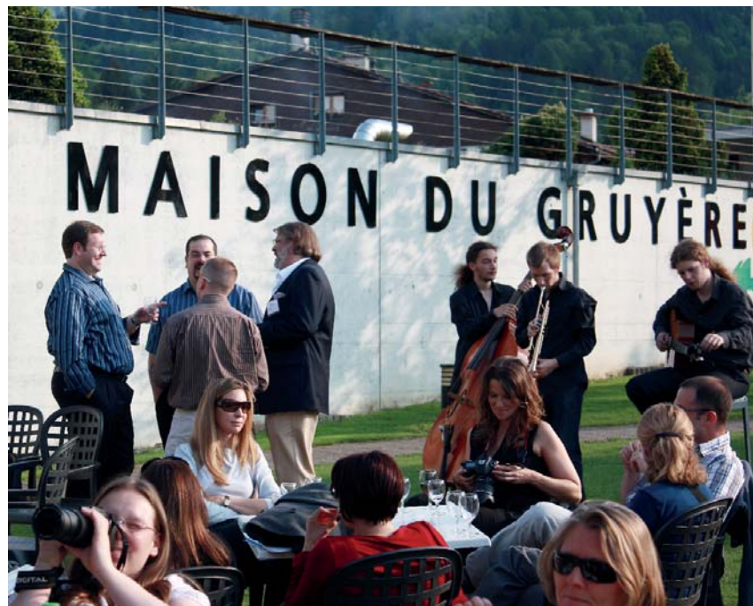
Discussions continue after the NAVA symposium.

The workshops were led by Professor Peter Rimensberger who started off with the observation that the way mechanical ventilation is administered has a large impact on patient outcome. Still, the way it is practiced is largely influenced by old traditions and many extrapolations from old literature, primarily conducted on healthy adult patients undergoing general anesthesia. This promotes reliance on "cook-book medicine" with very little room for an individual approach based on patient physiology to the setting of the ventilator. Professor Rimensberger rebuked standard practice and offered an alternative approach